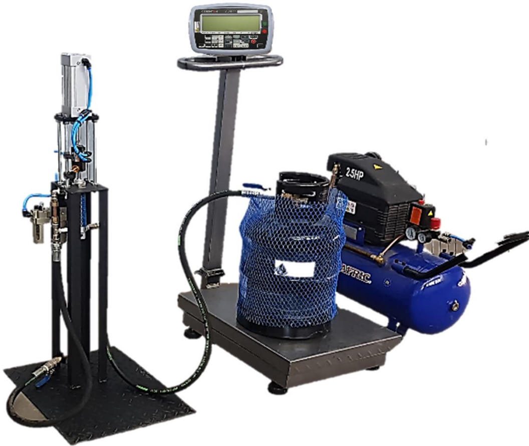
Compressor with output controller

CWB22 set-point controlled indicator with 150kg platform